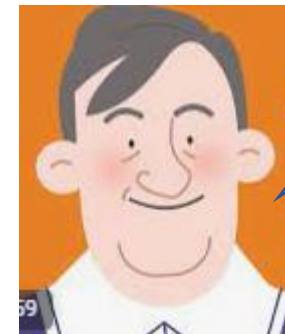
Stephen Fry – a Humanist